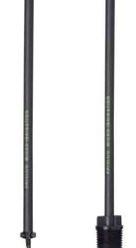
Rigid Riser with "Quick" thread adapter